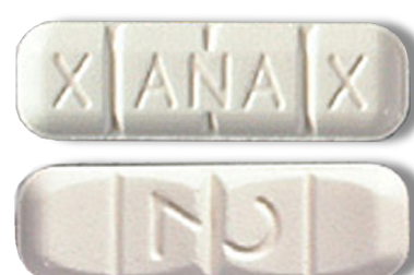
2mg: white, oblong, multi-scored, imprinted 'XANAX' on one side and '2' on the reverse side.

Yellow and green Xanax bars are 2mg. Red/Pink Xanax bars either generic or fake have been thought to be up to 5mg. Pharmaceutical Xanax comes in controlled release form (up to 12 hours) and instant release form (3-6 hours) and is also available as an oral solution.