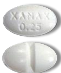
0.25mg: white, oval, scored, imprinted 'XANAX 0.25'

Appearance: Legitimate pharmaceutical Xanax comes in doses of: