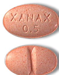
0.5mg: peach, oval, scored, imprinted 'XANAX 0.5'