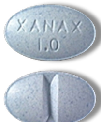
1mg: blue, oval, scored, imprinted 'XANAX 1.0'