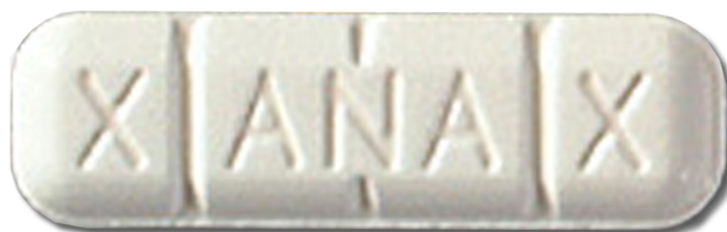
2mg Xanax bar

Background: Although reports of alprazolam use and adulteration date back a decade or more 2 the recreational use of benzodiazepines in the UK has typically involved those prescribed by the NHS, in particular diazepam diverted from regulated supplies or imported. 3