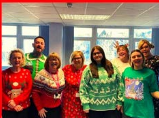
CHRISTMAS JUMPER DAY

Staff within our Cwm Taf and Bridgend services, rocked the Christmas Jumpers for Save the Children, on 8th December