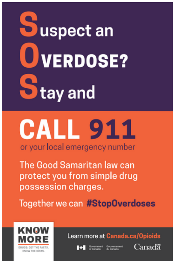
Image: Poster used to raise awareness of the Good Samaritan Drug Overdose Act in Canada. [2]

As of 2021, the jurisdictions within the United States that have implemented a DOGSA, there was a 7% decrease of all overdose deaths and 10% lower rates in opioid-related deaths compared to rates prior to enactment, and death rates in states without such laws. [6]