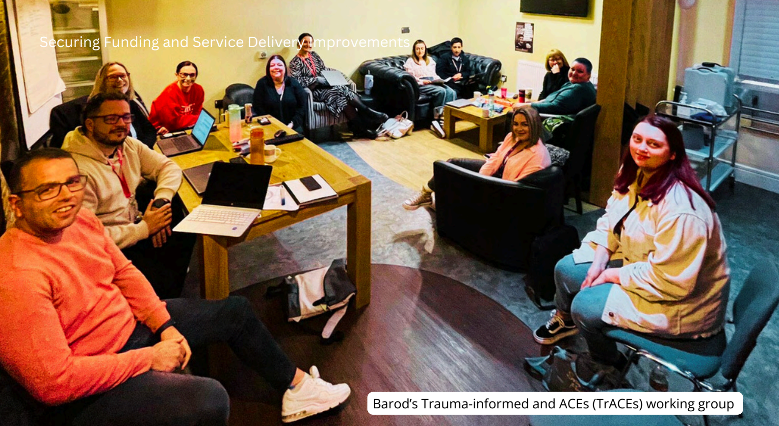
Barod's Trauma-informed and ACEs (TrACEs) working group