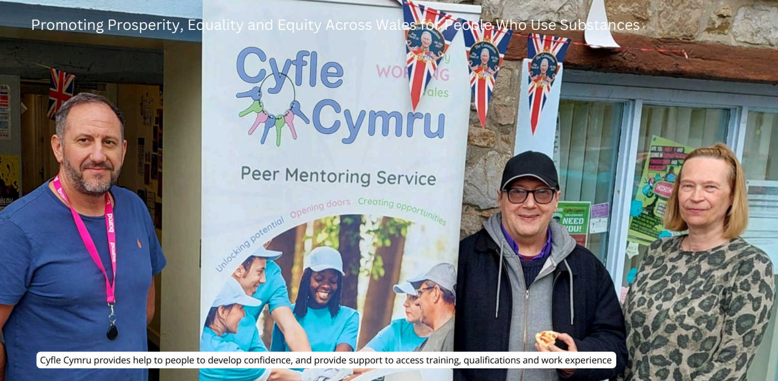
Cyfle Cymru provides help to people to develop confidence, and provide support to access training, qualifications and work experience

Current legislation acts as a form of stigma that can hinder people from seeking support for their alcohol use. People who may benefit from such support, may not wish to disclose their alcohol use with their employers due to fear of being inadequately supported or even losing their job. In turn this may result in them not engaging with substance use treatment services and subsequently, lead to further isolation and additional harm.