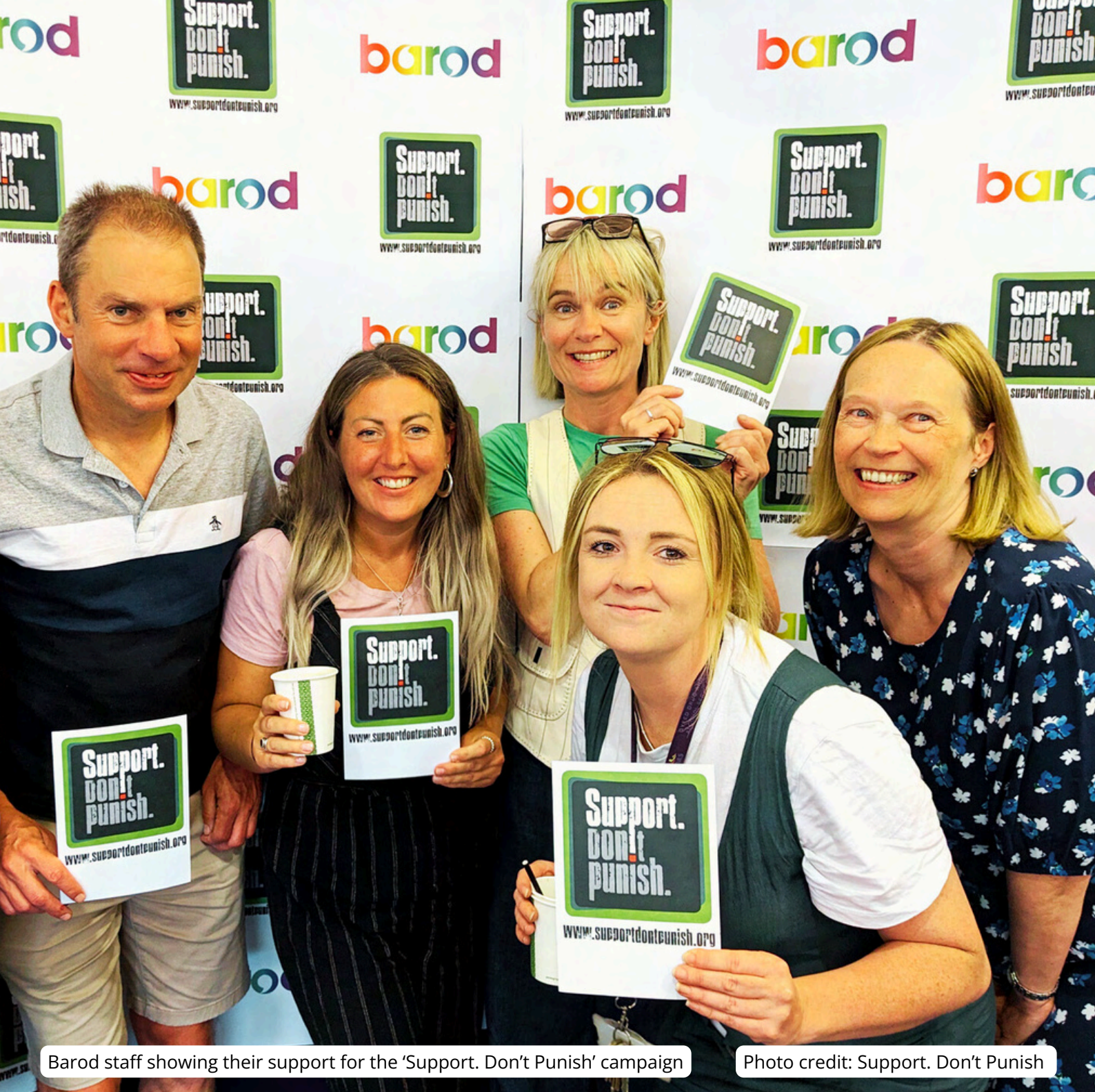
Barod staff showing their support for the 'Support. Don't Punish' campaign