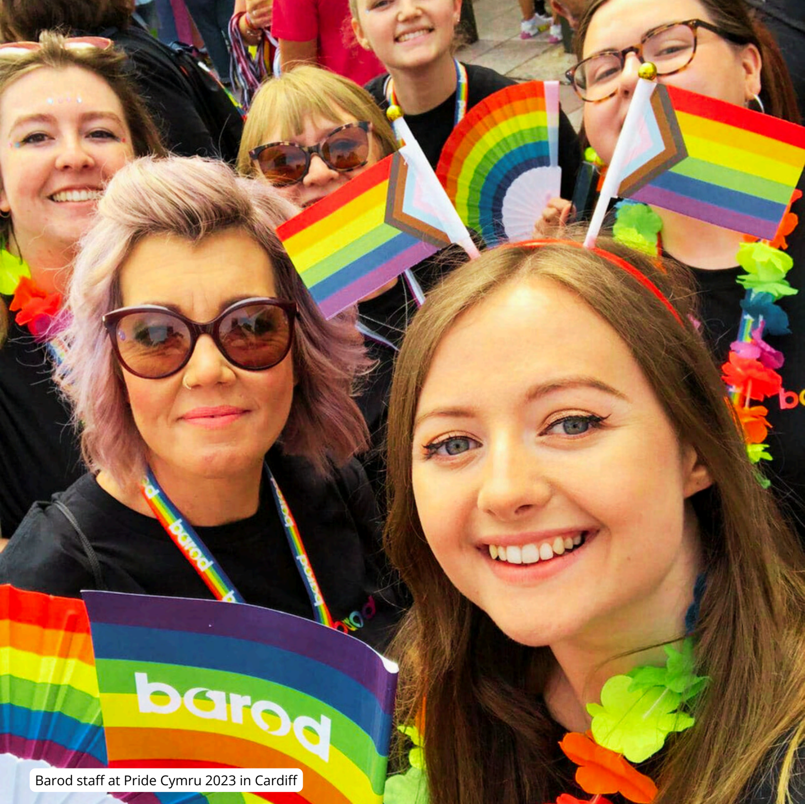
Barod staff at Pride Cymru 2023 in Cardiff