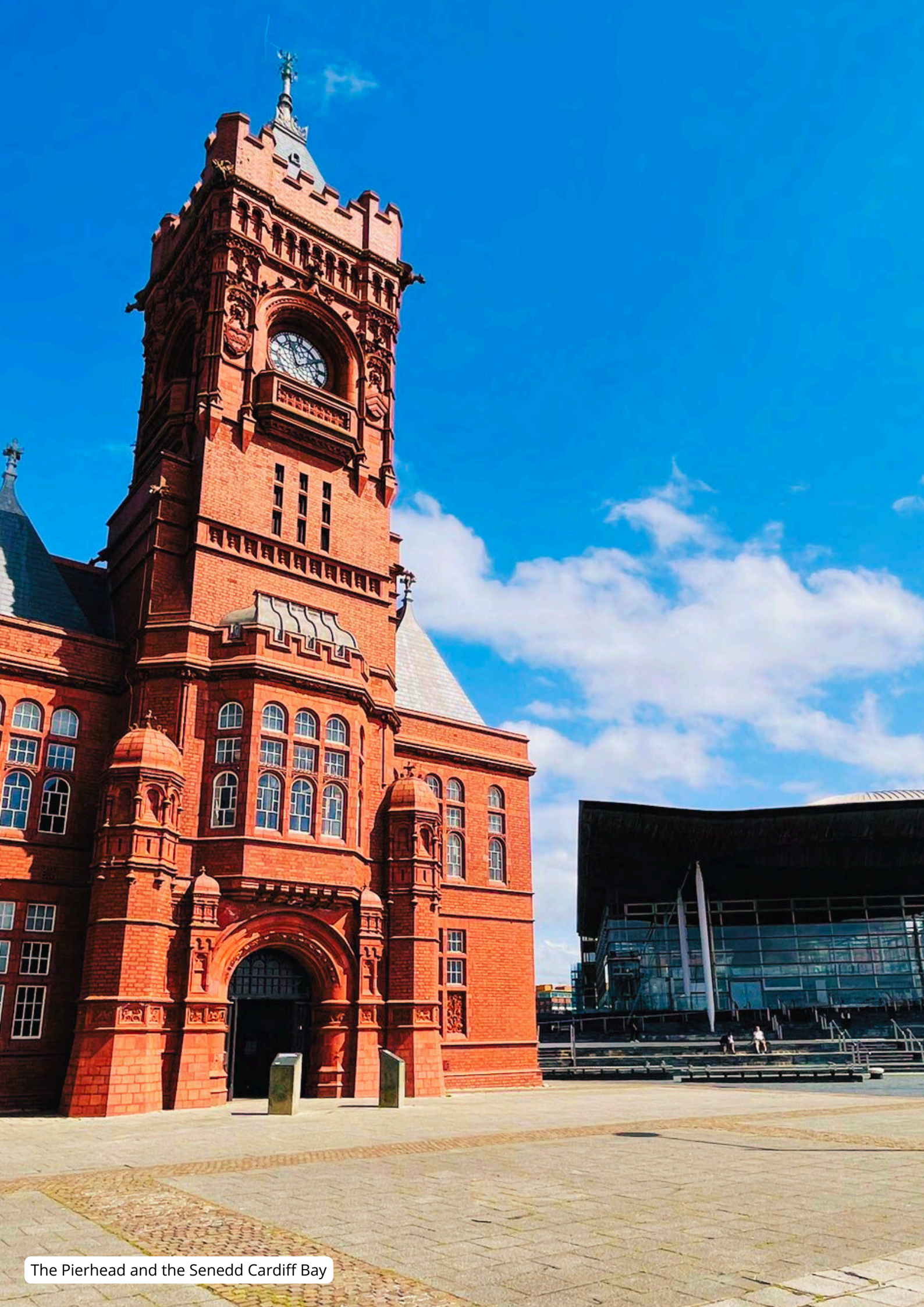
The Pierhead and the Senedd Cardiff Bay