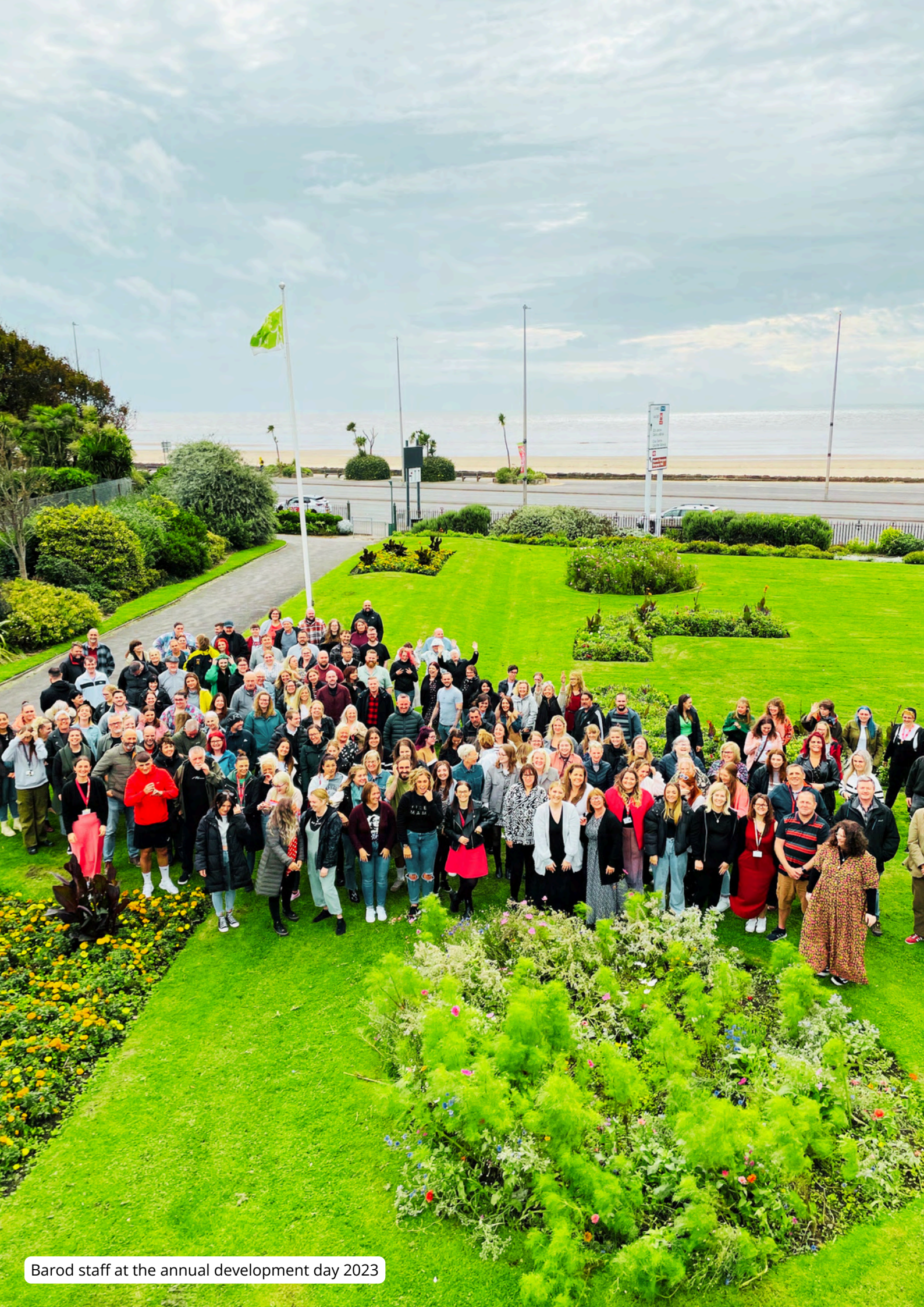
Barod staff at the annual development day 2023