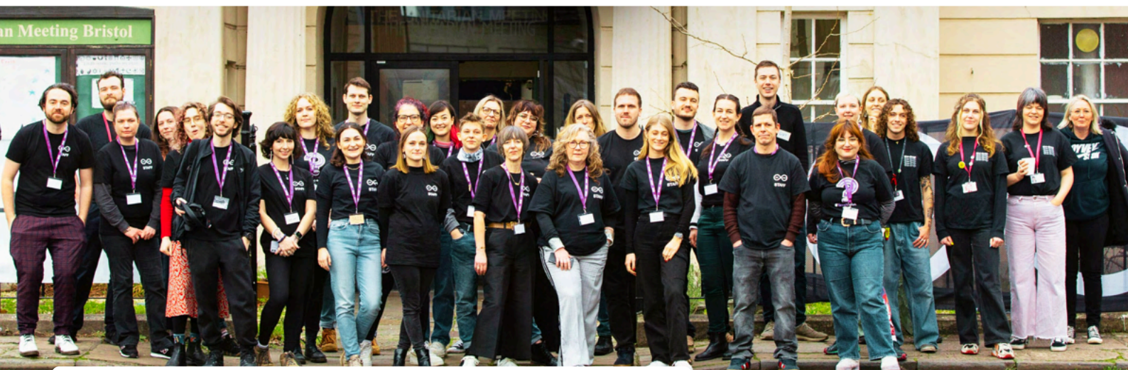
The Loop team at the UK's first regular drug checking service in Bristol.